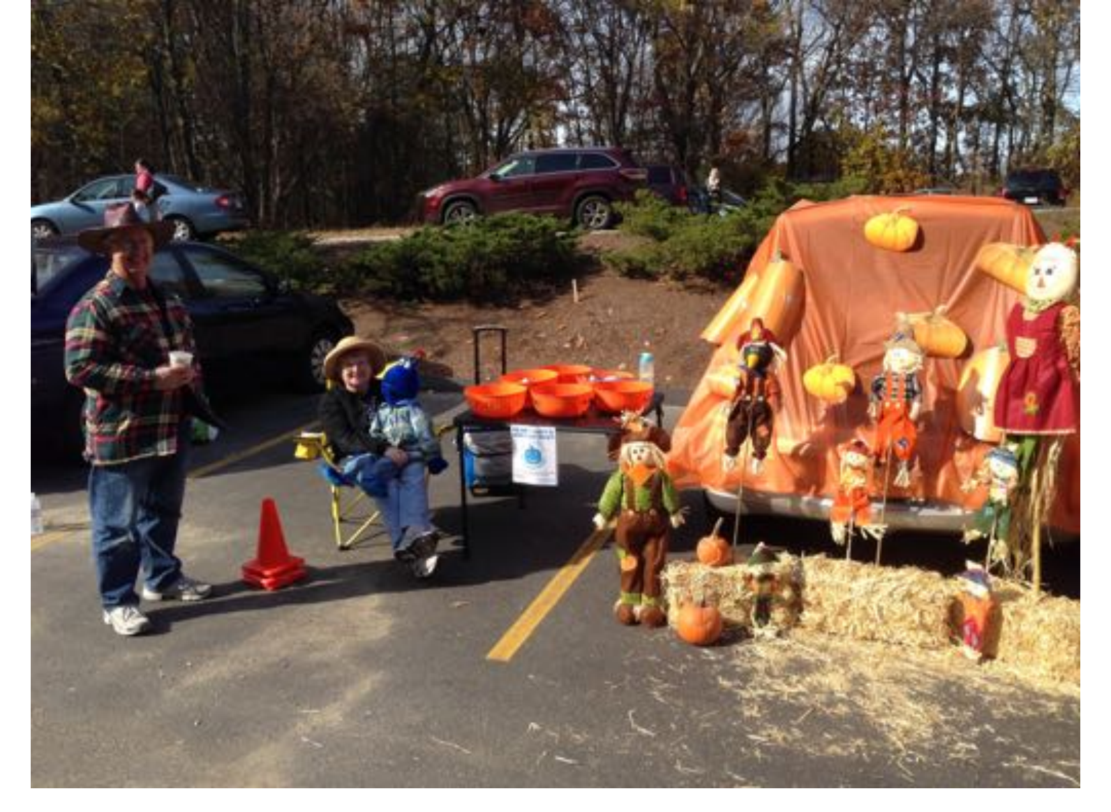
Trunk or Treat