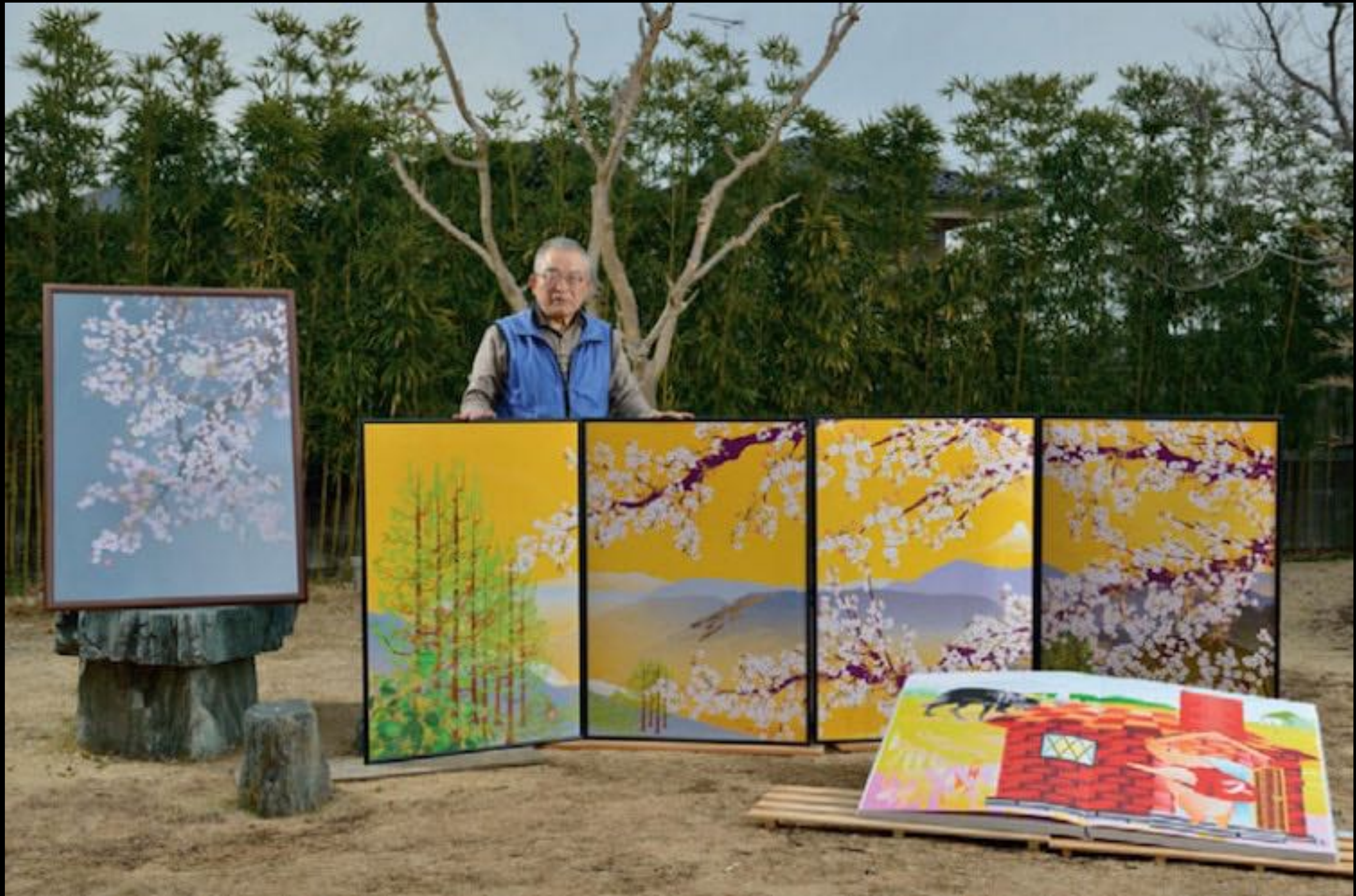
Tatsuo Horiuchi - Photo via: https://mymodernmet.com/tatsuo-horiuchi-excel-spreadsheet-paintings/