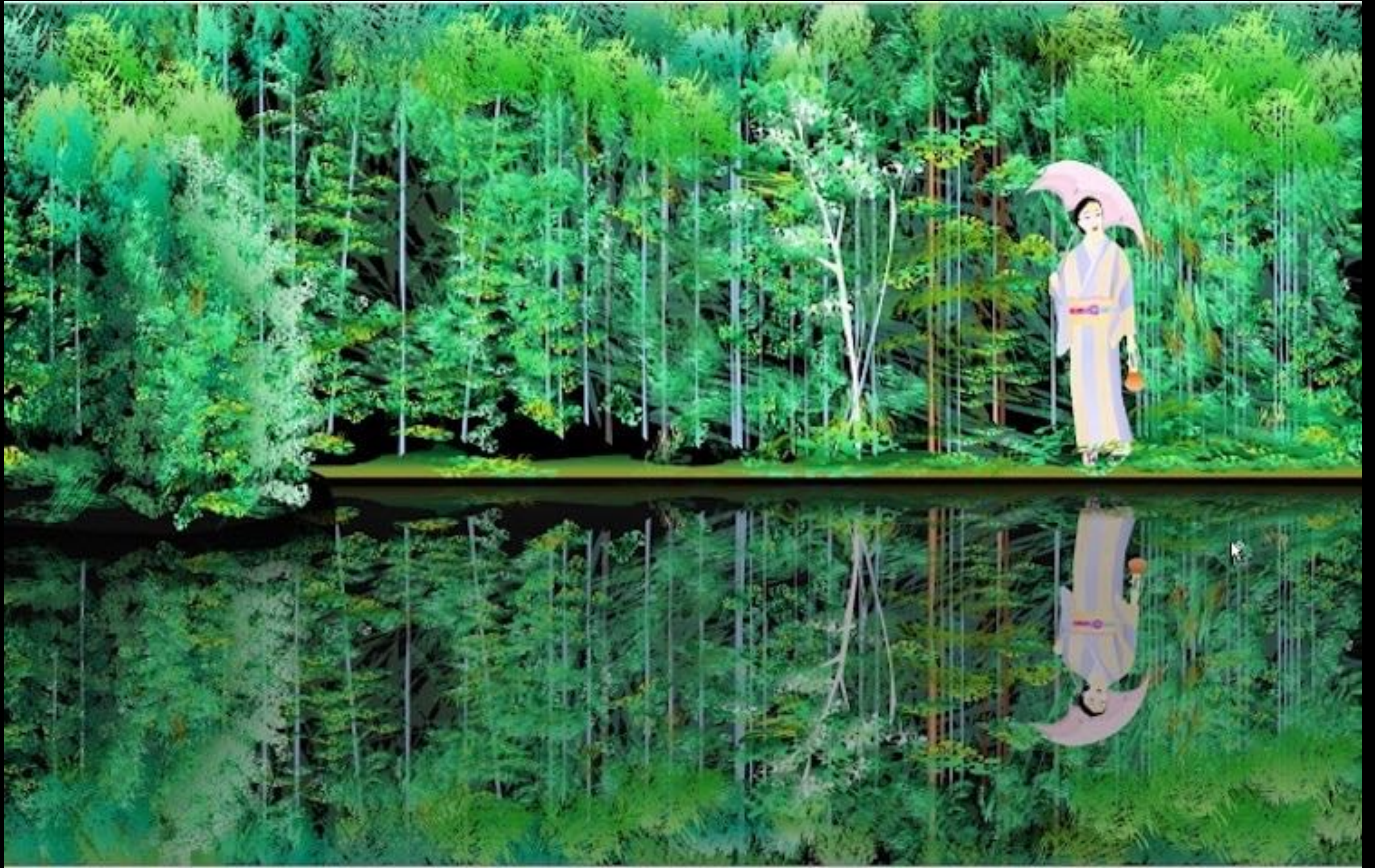
Tatsuo Horiuch