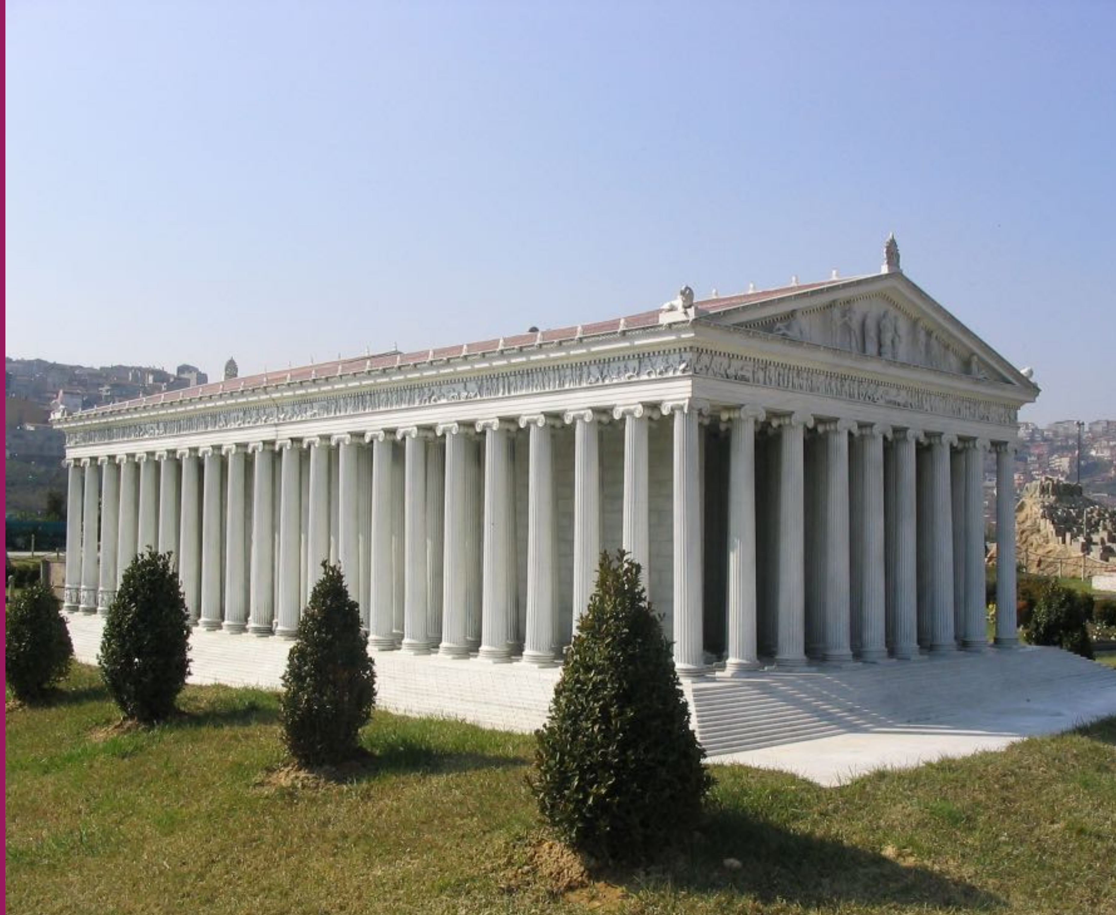
Model of Temple of Artemis