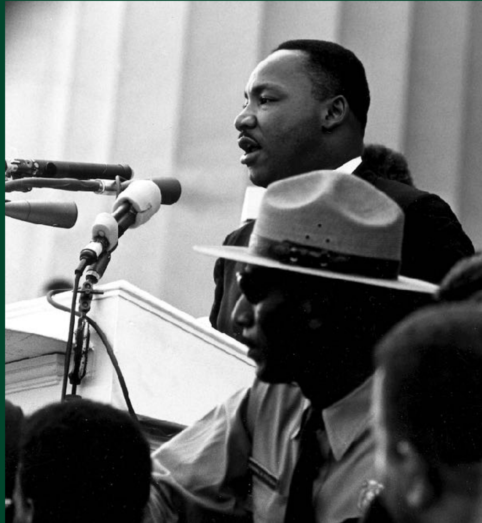
Photo above from "I Have a Dream" speech. Quote below from Stride Toward Freedom: The Montgomery Story .

“... the greatest tragedy of this period of social transition was not the strident clamor of the bad people, but the appalling silence of the good people.” - Martin Luther King, Jr.